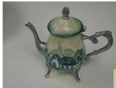
Sample of work by Decorative Artists

Creations by The Decorative Artists of Southwest Florida (DASF) will be on display on the walls of the gallery as well as in the cases. Members of DASF also belong to the international Society of Decorative Painters. Their objective is to promote the art of painting for those who wish to learn to paint in any of a wide variety of mediums. DASF welcomes people of all ages and all levels of ability ranging from those with no experience to the accomplished professional artist. Members are most generous in sharing their talents and their time. Examples of work created by the Decorative Artists include painted furniture, trays, wall pictures, shoes, caddies, serving pieces and much, much more. Visit www.DASFartists.com for more information about the organization.