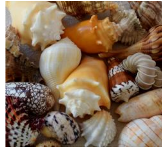
Howard Wolper photograph Shells