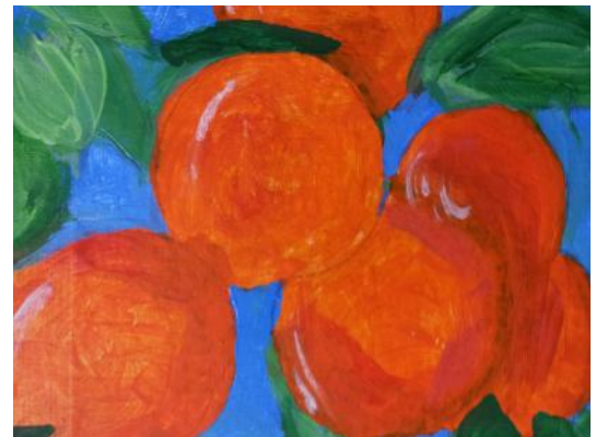
Above: Artwork in Special Populations Exhibit

Creations by The Decorative Artists of Southwest Florida (DASF) will be on display on the walls of the gallery as well as in the cases. Members of DASF also belong to the international Society of Decorative Painters. Their objective is to promote the art of painting for those who wish to learn to paint in any of a wide variety of mediums. DASF welcomes people of all ages and all levels of ability ranging from those with no experience to the accomplished professional artist. Members are most generous in sharing their talents and their time. Examples of work created by the Decorative Artists include painted furniture, trays, wall pictures, shoes, caddies, serving pieces and much, much more. Visit www.DASFartists.com for more information about the organization.